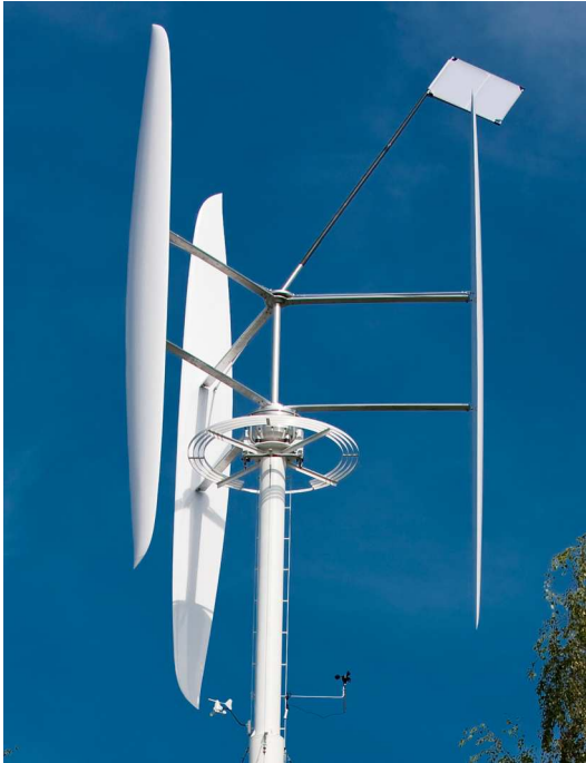
WES 10KW wind turbine